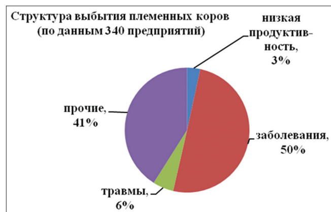
Figure 2: Structure of breeding cow disposal at agricultural enterprises (2015, n = 340 ). низкая продуктивность - Low productivity, заболевания - Diseases, травмы - Injuries, прочие - Other

Biogeochemical, technological and financial heterogeneity of agricultural enterprises determines the various mechanisms of cow adaptation to specific production conditions and develops a specific pathology structure for each enterprise. The effectiveness of therapeutic and prophylactic measures directly depends on the degree of a pathological process development. [6] Therefore, a timely donor zoological diagnostics of deviations in the conditions of a particular production comes to the forefront. [7,8]